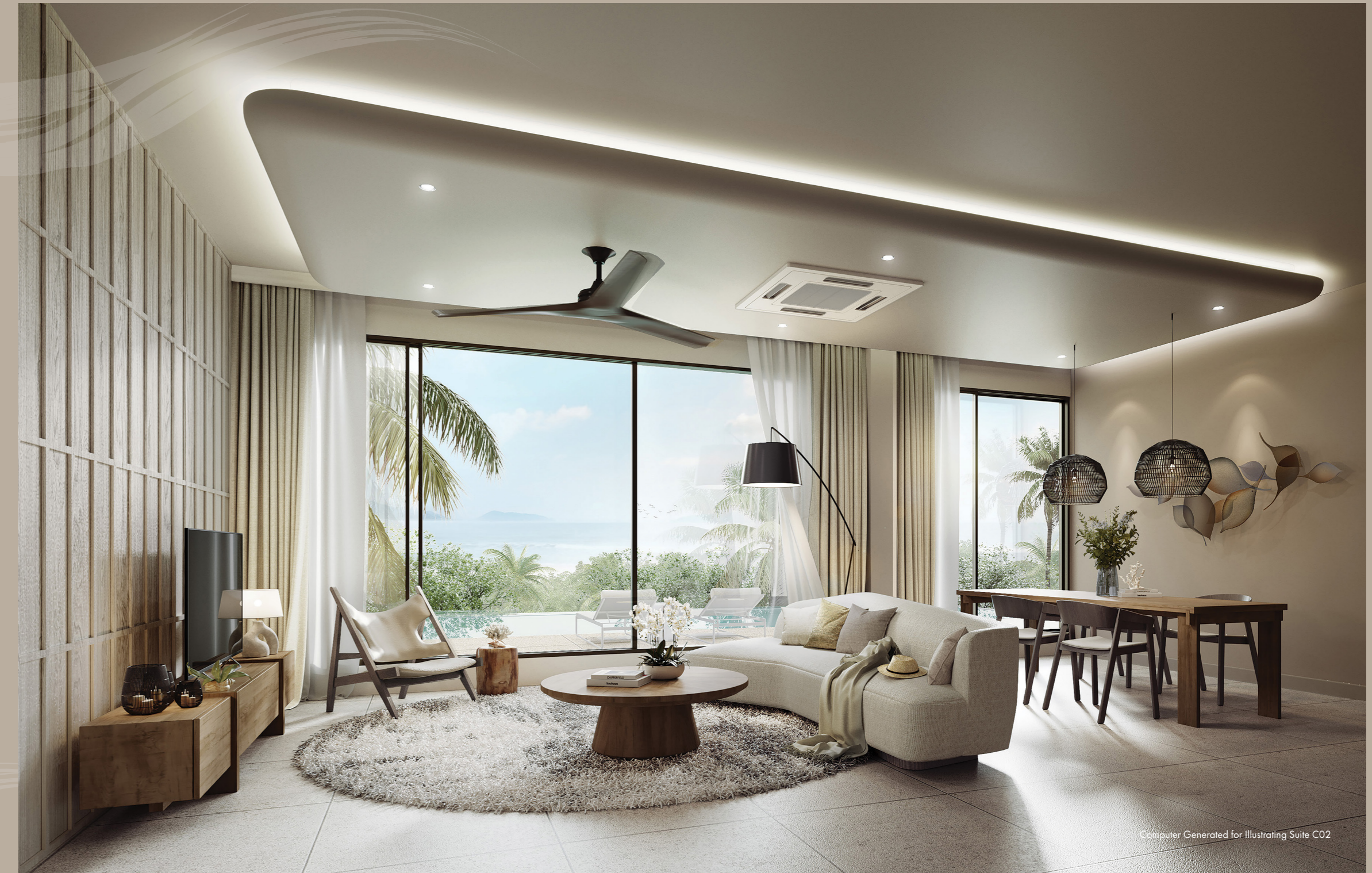
Computer Generated for Illustrating Suite C02