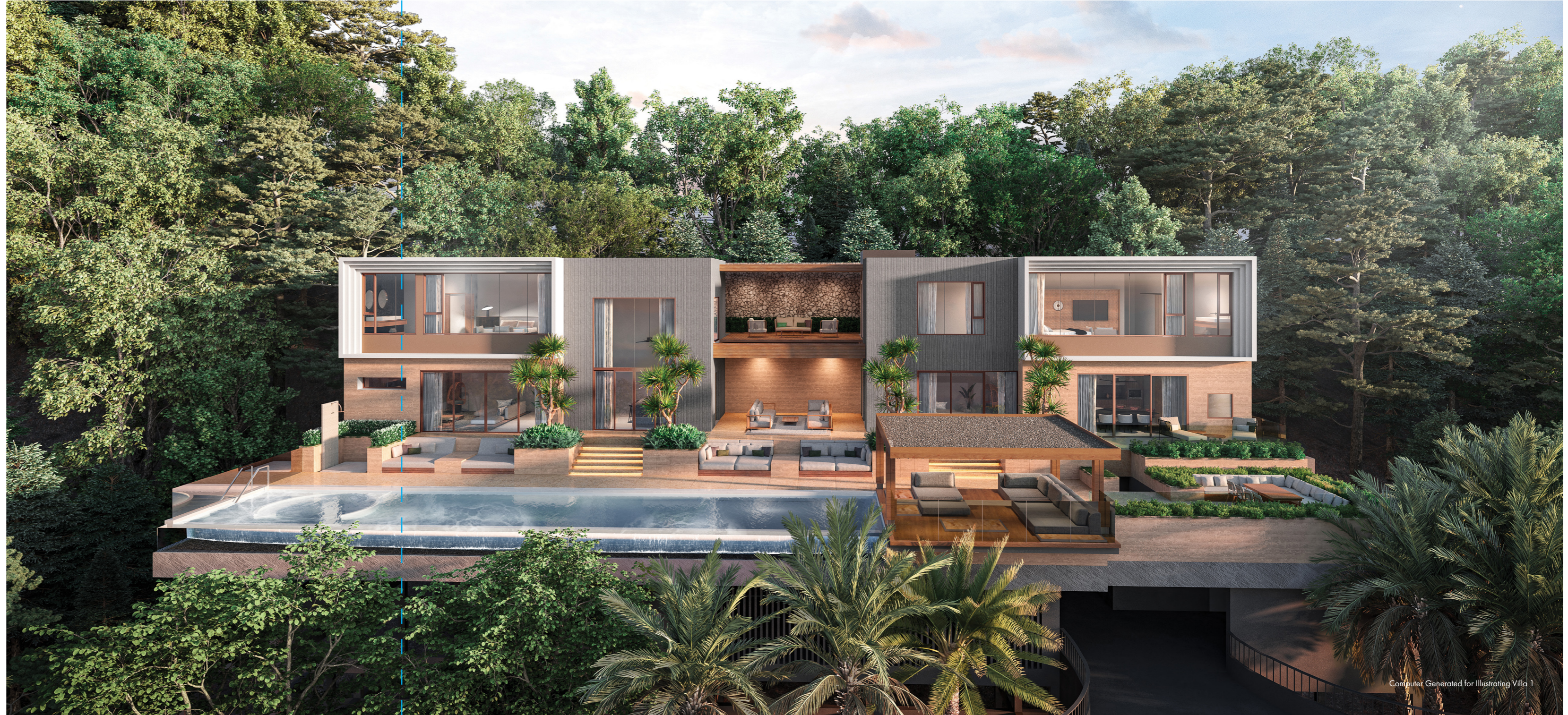
Computer Generated for Illustrating Villa 1