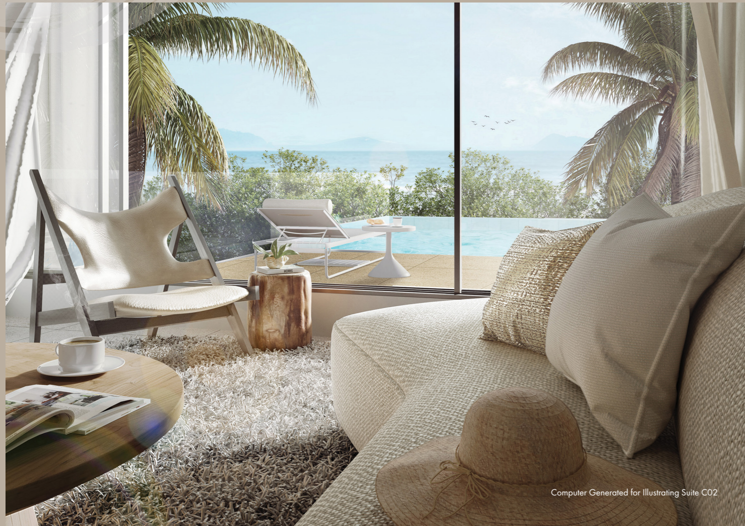
Computer Generated for Illustrating Suite C02

Delight in the seamless harmony of indoor and outdoor living, as large glass doors perfectly highlight glorious tropical vistas, creating luxuriously uplifting and airy living spaces that make you feel instantly refreshed and renewed.