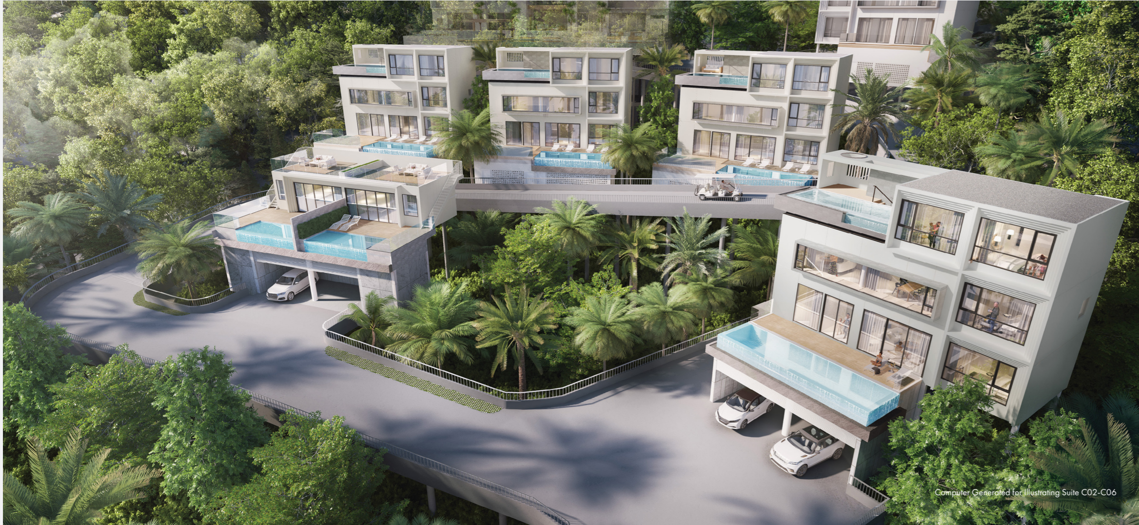
Computer Generated for Illustrating Suite C02-C06